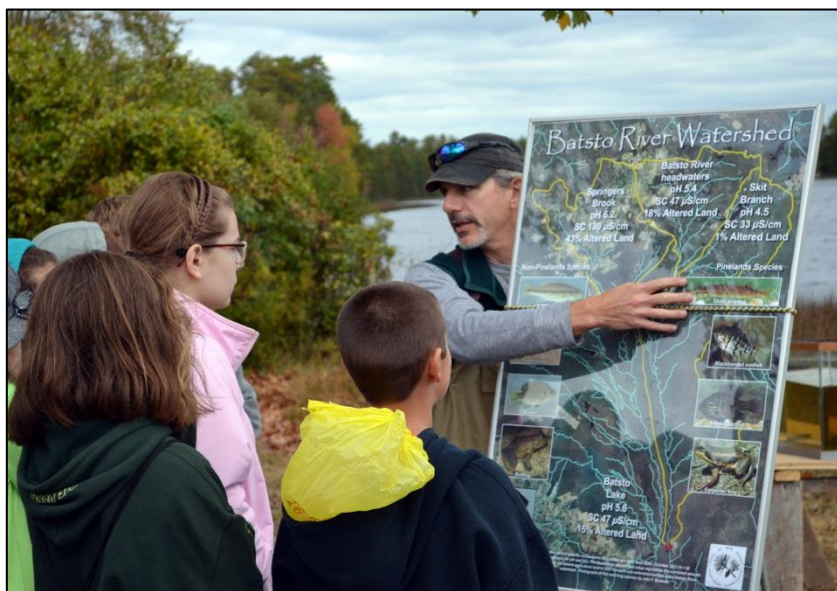
John Bunnell, the Commission's Chief Scientist, described the Batsto River Watershed during the eighth annual Pinelands-themed World Water Monitoring Day event.

Staff organized and carried out its eighth annual, Pinelands-themed World Water Monitoring Day event. Held at the historic Batsto Village, the event attracted more than 250 students and teachers who gauged Pinelands water quality and learned about the importance of protecting the region's unique natural and historic resources.