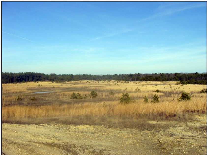
In 2014, the Commission permanently preserved a 195-acre property (above) in Jackson, Manchester and Toms River townships.

The Commission provided $292,202 of the total $2 million cost to acquire the land, which is located in Jackson, Manchester and Toms River townships. The Ocean County Natural Lands Trust funded the remainder and now owns the property.