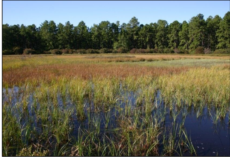
Natural ponds, such as this one in Brendan Byrne State Forest, provide habitat for many species of Pinelands plants and animals.

Commission scientists continued to make progress on a study to characterize the vulnerability of Pinelands ponds to surrounding land uses. Scientists began the first phase of the project by using aerial photography to compile an inventory of approximately 3,000 natural Pinelands ponds. Ninety-nine of these ponds were selected for the study. In 2014, scientists began to monitor water quality and hydrology at all 99 ponds and completed plant and animal surveys at 53 of the ponds.