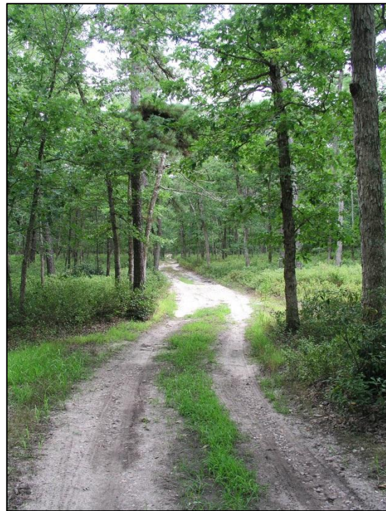
Stockton College deed-restricted more than 1,200 acres of high-integrity habitat as part of its 2010 Master Plan, including the property above.

The College's 2010 Master Plan identifies on-campus development projects during the course of the next 20 years, based on projected student enrollment. The College's potential development projects include nearly 2.4 million square feet of new development, nearly 11,000 new parking spaces and more than 3,100 new dwelling units, most of which are dormitories. All of these projects are delineated on Designated Development Areas. The Commission has reviewed these areas and it has determined that the areas do not involve any resources, structures or areas of significance under the Comprehensive Management Plan.