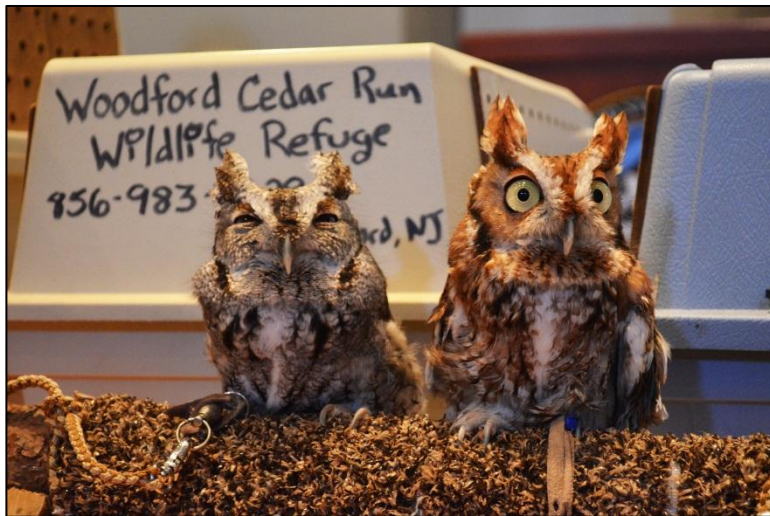
The 25 th annual Pinelands Short Course featured 36 presentations, including one on owls of New Jersey (shown above).

The daylong event was held at The Richard Stockton College of New Jersey in Galloway Township, Atlantic County on March 8, 2014. Stockton hosted the Short Course for the first time since 2003. The event had been held at Burlington County College's Pemberton campus from 2004 to 2013.