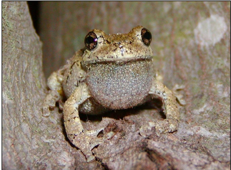
Some stormwater basins can provide breeding habitat for the endangered southern gray treefrog.

Like natural wetlands, created wetlands can provide the habitat necessary for wetland-dependent plants and animals, especially in human-dominated landscapes where natural wetlands may have been degraded or eliminated. As part of another study, Commission scientists mapped the location of two types of created wetlands commonly found in the Pinelands, shallow excavations that intercept the groundwater (excavated ponds) and excavations designed to receive stormwater (stormwater basins). About 2,000 excavated ponds and 1,700 stormwater