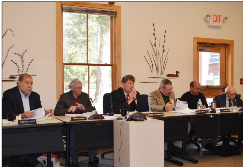
The Commission adopted several amendments to the Pinelands Comprehensive Management Plan in 2014.

More specifically, the amendments serve to codify current Commission practice, clarify existing standards and requirements, increase the efficiency of the Commission and its staff, eliminate unnecessary application requirements and correct typographical errors in the regulations. The